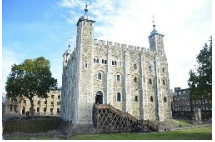
The Tower of London.

The British Museum in London is dedicated to the history of humanity. With its inception was the will of Sir Hans Sloane which bequeathed 71,000 articles to the British Nation for the presentation of the Museum to the world. Its doors were open in 1759. It contains the largest collection of archaeological artifacts in the world. These artifacts provide proof of